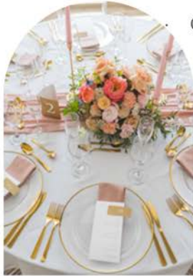
LOW SEASON (OCTOBER - APRIL)

Weekdays (Monday - Thursday) £3,000 Weekends (Friday - Sunday) £3,600