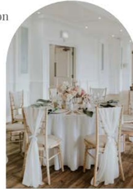
HIGH SEASON (MAY - SEPTEMBER)

Weekdays (Monday - Thursday) £3,000 Weekends (Friday - Sunday) £3,600